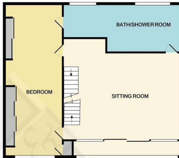
1ST FLOOR APPROX. FLOOR AREA 780 SQ.FT. (72.5 SQ.M.)