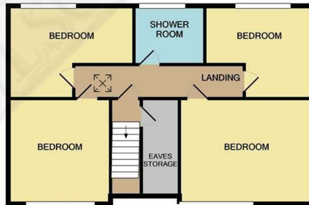
2ND FLOOR APPROX. FLOOR AREA 580 SQ.FT. (53.9 SQ.M.)

TOTAL APPROX. FLOOR AREA 2530 SQ.FT. (235.1 SQ.M.)